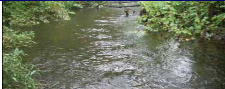
Plattekill Creek tributary Station PL03 just upstream of the Schrieber lane culvert.

The purpose of this Watershed Report Card is to identify specific water quality problems and raise public awareness of important watershed issues in local Hudson Valley communities. Hudson Basin River Watch selected locations with input from local stakeholders and assessed water quality impacts (pollution) at six stream stations in the Plattekill Brook Watershed. The Plattekill Brook is a small stream that originates in the town of Plattekill, and flows through the towns of Gardiner and New Paltz before entering the Wallkill River. This stream was studied with the intent that data from its assessment could facilitate intermunicipal cooperation in the protection and management of this small, but important watershed. It is one of the few viable trout streams left in these three towns.