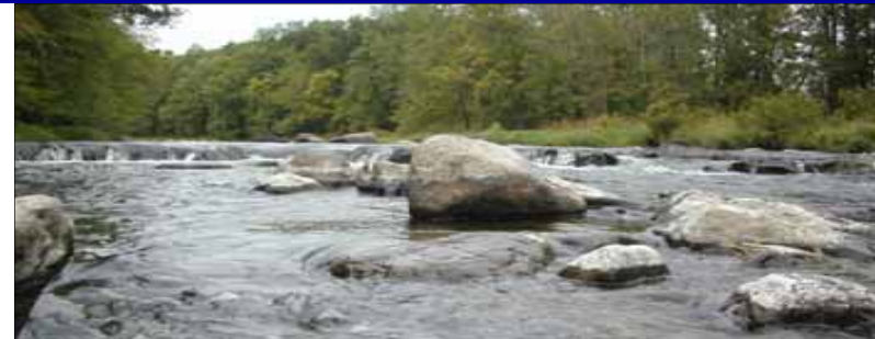
Shawangunk Kill, station 21214, located at the end of Sax Rd. Shawangunk Ulster County NY.

The purpose of this Watershed Report Card is to identify specific water quality problems and raise public awareness of important watershed issues in Hudson Valley communities. Hudson Basin River Watch selected locations with input from local stakeholders and assessed water quality impacts (pollution) at ten stream stations in the Wallkill River Watershed. Macroinvertebrate samples and basic physical and chemical data were collected in September 2006. A map depicting the sampling locations and impact categories is on pages 2-3 of this brochure. Water quality was non-impacted at four stations, slightly impacted at five stations, and moderately impacted at one station. The most likely cause of any water quality impacts is natural at six stations, non point source nutrient additions at three stations, and siltation at one station.